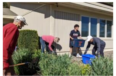
Clean-up day, 2023